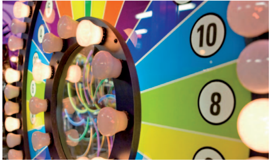
It needn't be just a wheel of fortune

After the most recent debacle, social investment professionals acknowledged and addressed the shortcomings of many screens that paid only cursory