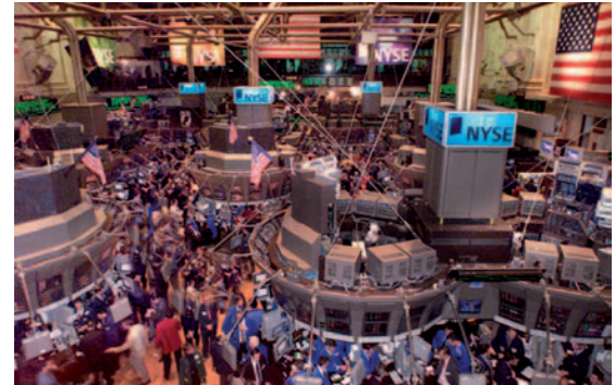
Lurching from crisis to crisis

As another philosopher, George Santayana, has written, history has a way of taking revenge on the heedless. According to Morningstar data, over the past 15 years social funds have been dramatically underweighted in the safest and most transparent sectors: industrials, energy and materials. Not only are they the backbone of the world economy, they are among the world's fastest growing sectors, as sleepy giants like China and India awaken. In the past five years, major social investor indices in the US, such as Domini (based on KLD research), that leaned heavily on financial stocks have dramatically trailed their benchmarks, erasing their competitive performance in the years before.