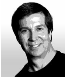
COLUMNIST: JON ENTINE

Renewable energy is not a virtue unto itself